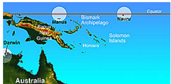
Tropical Western Pacific