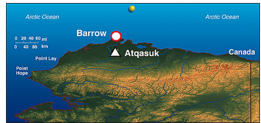
North Slope of Alaska