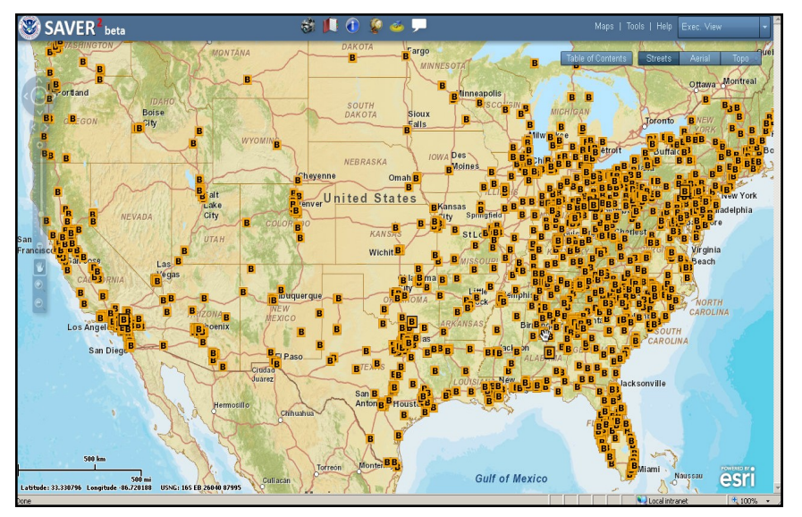
Big Lots locations displayed in SAVER<sup>2</sup>

SAVER<sup>2</sup> will allow for the visualization and analysis of operationally relevant information to be