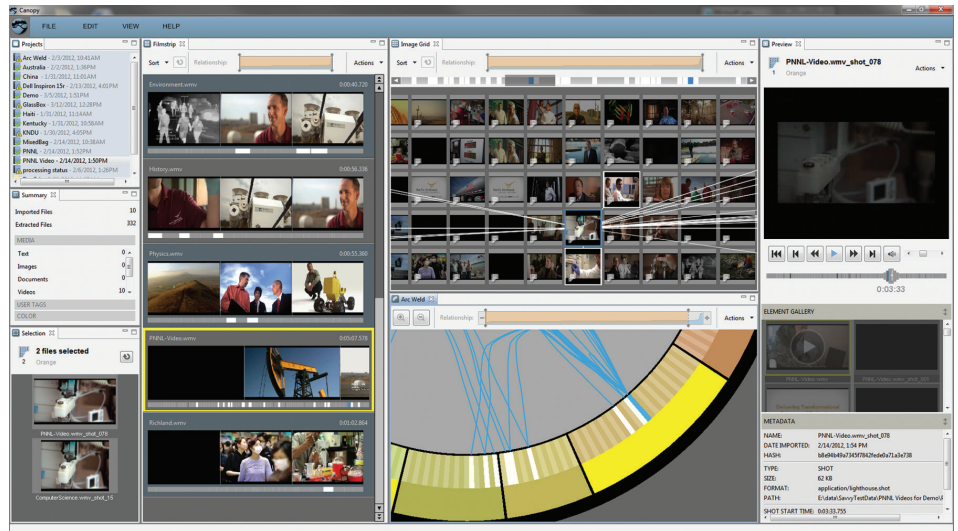
Multiple visualizations in Canopy provide insight into multimedia collections.

Canopy is an analytic software suite of interactive visualizations that supports overview, analysis, and discovery in mixed media data. We normalize and decompose mixed media content into the base types of text, image, and video. We apply type-specific analysis while maintaining context to the original document. A series of algorithms for analyzing text, images, and video are applied to identify features within the base types. From these features, trained classifiers help populate categories for the purpose of filtering and sorting. We link the analysis of multiple base types together when the types were originally extracted from the same document so analyst can understand the inter document and cross document relationships. Canopy has been developed