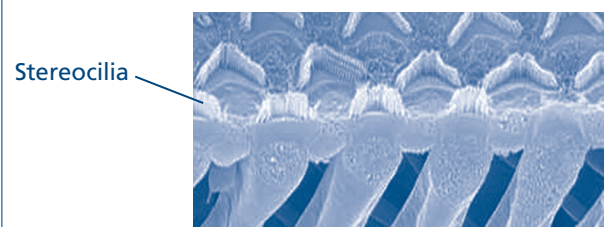
Hair cells in the inner ear