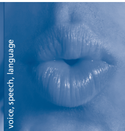
voice, speech, language

NIDCD supports and conducts research and research training on the normal and disordered processes of hearing, balance, smell, taste, voice, speech, and language and provides health information, based upon scientific discovery, to the public.