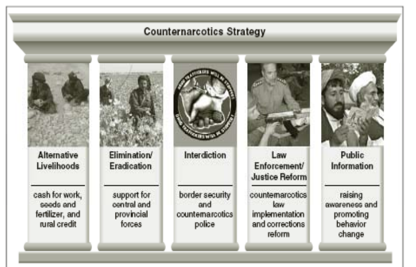
Figure 3. Five Pillars of the U.S. Counternarcotics Strategy.<sup>49</sup>

Working with the UK and the Afghan government, the United States developed its own strategy to counter the opium problem in Afghanistan, which has the following five pillars: alternative livelihoods, elimination and eradication, interdiction, law enforcement and justice reform, and public information (see Figure 3). The Department of State (DoS), the U.S. Agency for International Development (USAID), the Department of Defense (DoD), and the Department of Justice (DoJ) are the primary organizations involved in carrying out this counternarcotics strategy.