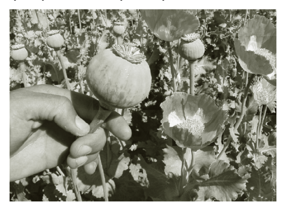
Figure 1. Opium Poppy Capsule. <sup>11</sup>

Opium poppy is a hardy, drought-resistant plant easily grown in most parts of Afghanistan, with a growing cycle that conveniently spreads the farmer's workload throughout the year. Opium poppy is usually planted between September and December and flowers after approximately 3 months. The flower's petals then fall away, leaving the plant's seed capsule containing an opaque, milky sap known as opium (see Figure 1). Harvested between April and July, the plump seed capsules are then lanced, allowing the opium sap to ooze out for collection after it has dried into a black tar-like substance. The opium sap is then refined into opiate-based products.