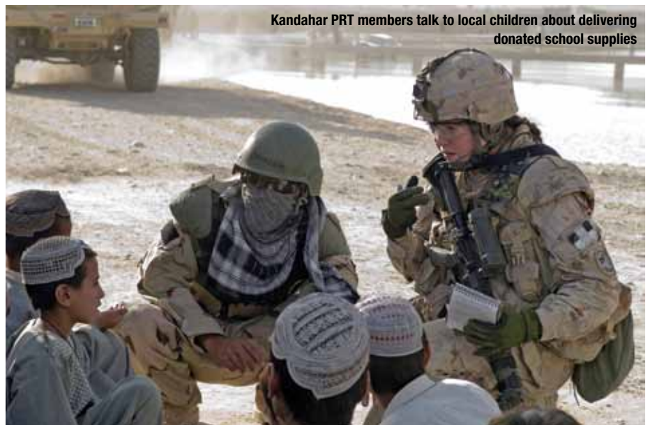
Kandahar PRT members talk to local children about delivering donated school supplies

At the present time, each donor- and troop-contributing nation retains the right to bilaterally engage Afghan ministries on their specific province according to their specific priorities. The Canadian embassy negotiates with the Ministry of Education about its