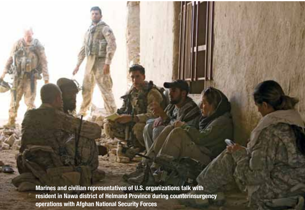
Marines and civilian representatives of U.S. organizations talk with resident in Nawa district of Helmand Province during counterinsurgency operations with Afghan National Security Forces