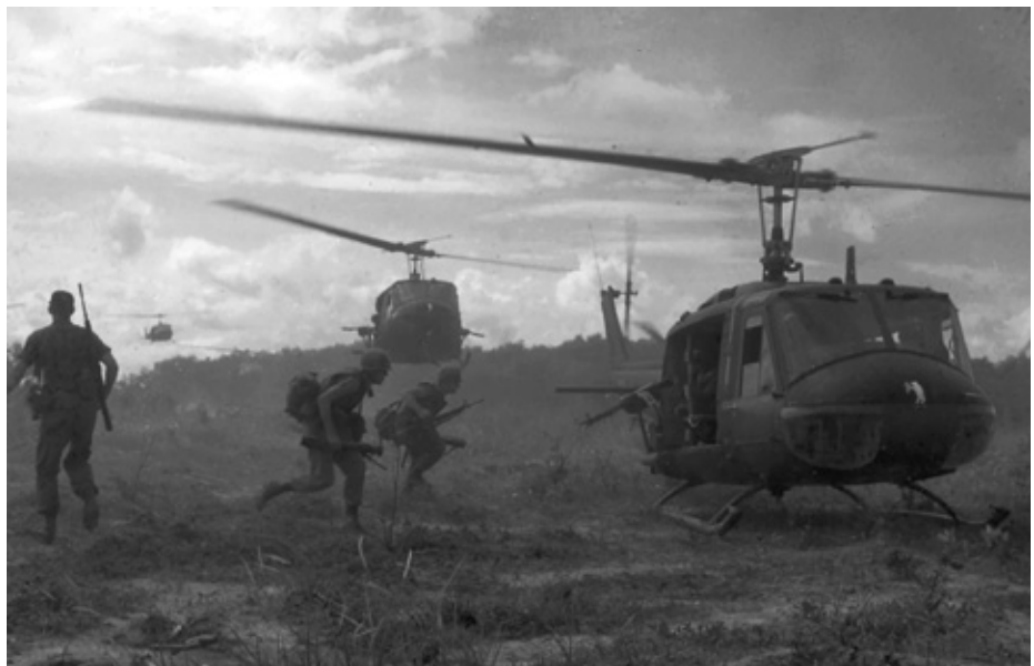
UH-1D helicopters airlift members of the 2nd Battalion, 14th Infantry Regiment from the Filhol Rubber Plantation area to a new staging area, during Operation “Wahiawa,” a search and destroy mission conducted by the 25th Infantry Division, northeast of Cu Chi, 1966.

The best vehicle for this, based on the success of the CORDS program in Vietnam and the chas-