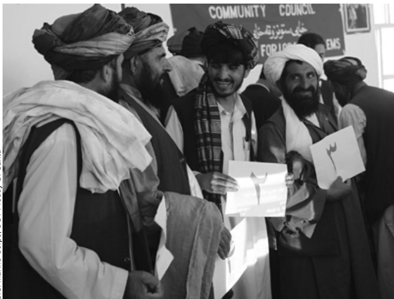
Village elders running for city council hold up numbers as locals cast votes during an election in the Helmand province of Afghanistan. Such elections set up highly counterproductive and destabilizing parallel governance bodies which further erode and undermine the authority and power of the local elders. The real winner of these elections is the Taliban.

village elders as contrasted with the current policy of trying to further marginalize them with local elections (and thus more local illegitimacy). Recent research has demonstrated conclusively that the Community Development Councils set up by the United Nations and the U.S. Agency for International Development in parallel to the tribal system increase instability and conflict, rather than reducing it. 25 Reestablishing local legitimacy of governance is, in fact, the one remaining chance to pull something resembling our security goals in Afghanistan out of the fatally flawed Bonn Process and the yawning jaws of defeat. The tragedy of Vietnam was that there were no political solutions. The tragedy of Afghanistan is that there is a political solution, but we keep ignoring it in favor of trying to force them to be like us.