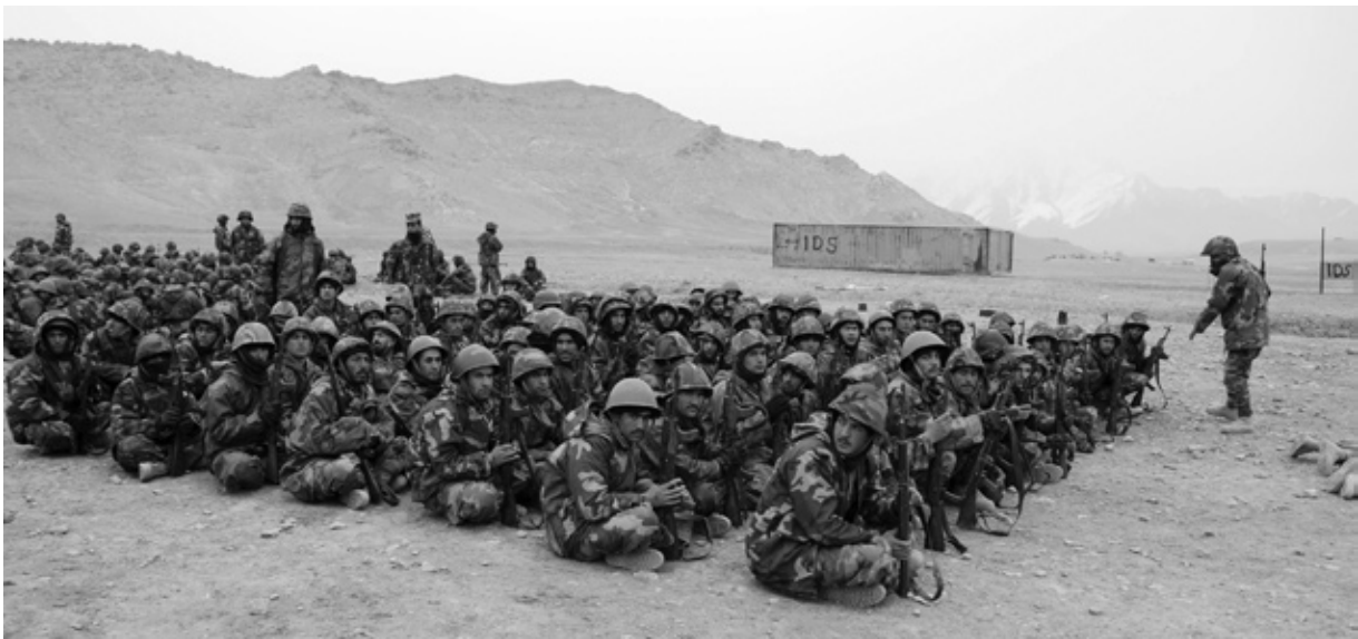
Afghan National Army trainees at the Kabul Military Training Center, 24 February 2007.

advanced infantry training, undergo another military specialty course, or be posted to their newly assigned units. 48 At the conclusion of this initial phase of training, the recruits become Afghan soldiers and are joined by their NCOs and officers.