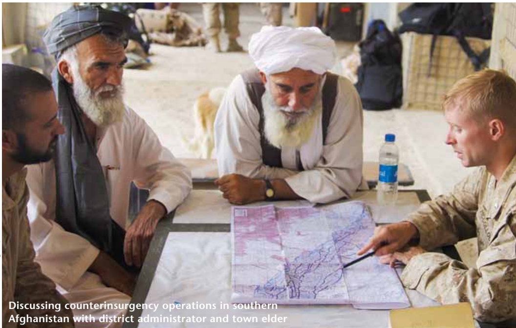
Discussing counterinsurgency operations in southern Afghanistan with district administrator and town elder

Political machines run by the likes of Plunkitt and Hinky Dink performed a function. They integrated the former outsiders—the immigrants—into the political system through party membership and organization. For reasons more complex than just “corrupt politicians,” patronage persists today, most blatantly in the form of “earmarks” where legislative votes are traded for “bringing home the bacon” (or “pork”). While many disdain legislators because of it, the failure to bring home the bacon can damage an elected official’s career. Behavior such as patronage—providing individual or small-group rewards to secure the beneficiary’s loyalty at the expense of the larger group—has persisted even after the dismantling of the political machine and despite its economic, policy, and moral defects.