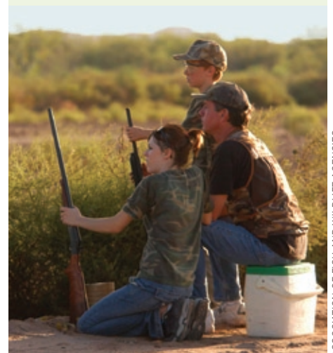
ASSOCIATION OF FISH AND WILDLIFE AGENCIES

In 2009, Congress urged the White House Council on Environmental Quality and the Department of the Interior (DOI) to develop a national, government-wide climate adaptation strategy to assist fish, wildlife, plants, and related ecological processes in becoming more resilient, adapting to, and surviving the impacts of climate change as part of the Fiscal Year 2010 Department of the Interior, Environment and Related Agencies Appropriations Act Conference Report.