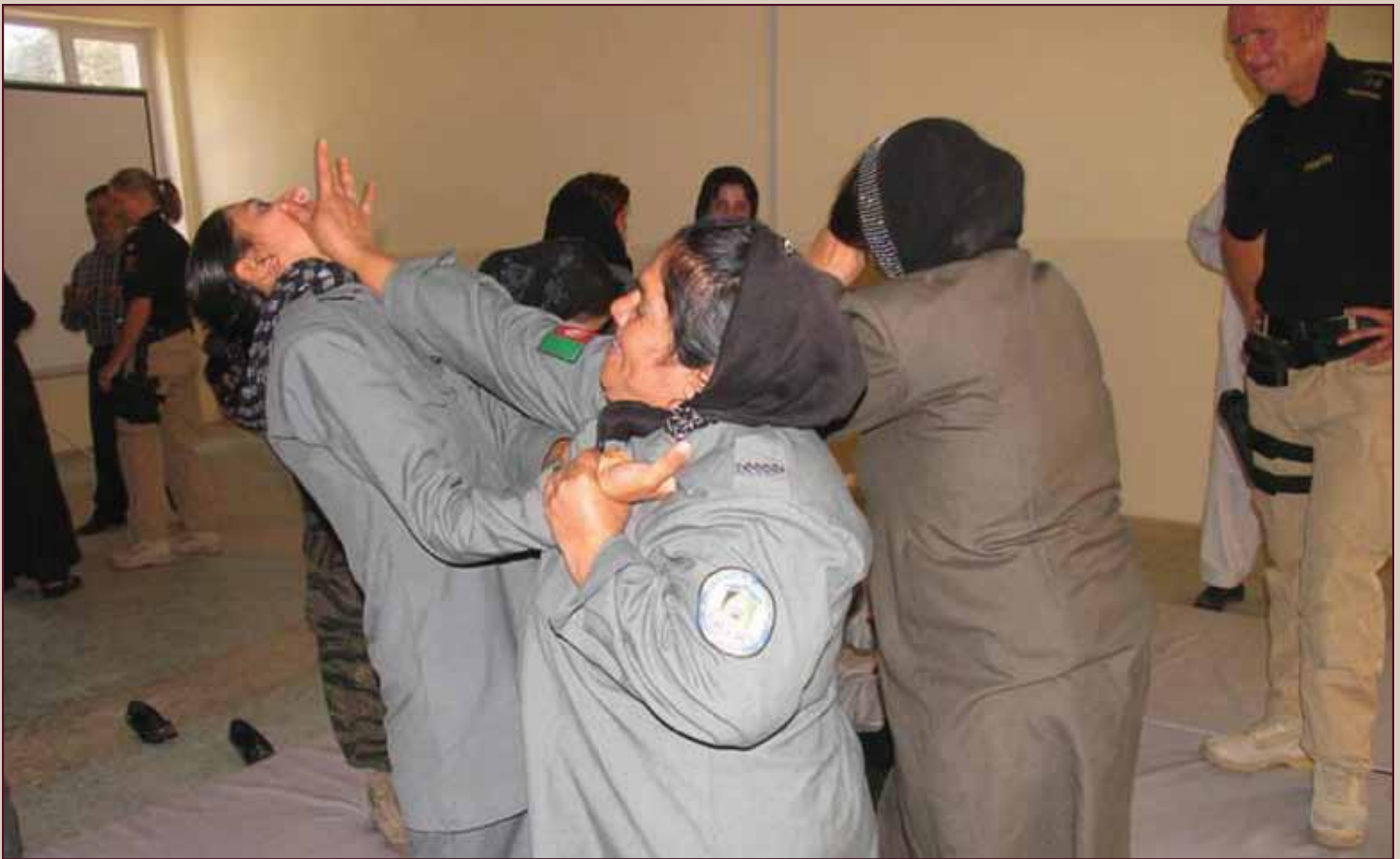
Female members of the Afghan National Police learn self defense training. These women stand side-by-side their male counterparts on the force.

members of the Afghan National Police (ANP). The PRT commander reiterated the need for a “gender tool box” to engage the other half of the Afghan population.