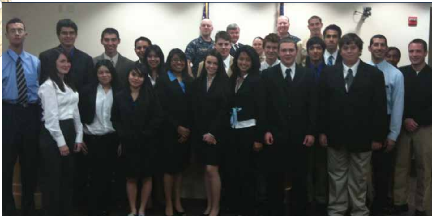
Members of Otay Ranch High School's Academy of Criminology and Justice at the mock trial clinic hosted by Region Legal Service Office and Navy Legal Service Office Southwest.