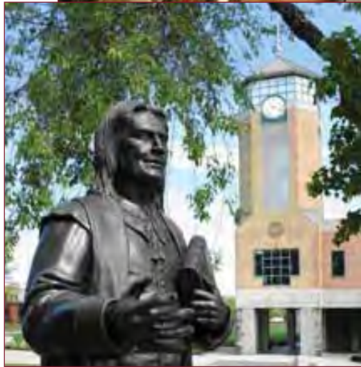
< The statue of Roger Williams and the clock tower of the University Library on the Roger Williams University campus.

ciate's Degree in Paralegal Studies or its equivalent within the next four to five years. To minimize the impact on current mission readiness, the LEI will be implemented in a phased approach and the JAG Corps will limit the number of legalmen concurrently enrolled in either program.