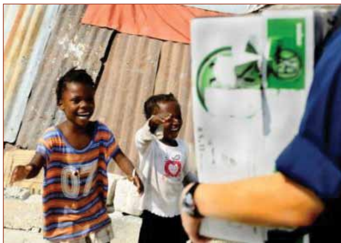
Children from a local orphanage run to greet USS Bataan Sailors as they deliver toys.

The following morning, I stirred briefly as reveille was called at 0600 before drifting back to sleep. At 0603, I woke again with a