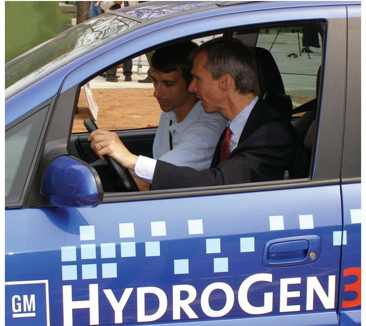
Representative Lipinski examines a hydrogen car, the type of innovation that could be eligible for the H-Prize.

Last December, Rep. Lipinski helped enact the Energy Independence and Security Act which will help create millions of jobs here at home and free us from our dependence on foreign oil. As Vice Chairman of the Science and Technology Committee, Rep. Lipinski authored a key provision in the bill – the H-Prize Act – which will facilitate an energy revolution and produce high-paying green jobs. The H-Prize Act establishes over $50 million in cash prizes for advances made in the use of hydrogen as a pollution-free replacement for gasoline.