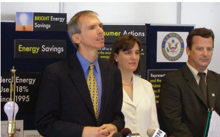
Rep. Lipinski introduces legislation to green federal government buildings.

Congressman Lipinski believes that Representatives must be responsible stewards of taxpayers' money. That is one reason he authored a key provision in the Energy Independence and Security Act enacted last December. This provision, known as the BRIGHT Energy Savings Act, will save energy by requiring the use of high efficiency light bulbs in federal buildings. This common-sense solution will significantly reduce energy consumption – about 75% savings for each of more than 3 million bulbs – potentially saving tens or hundreds of millions of taxpayer dollars.