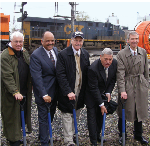
Rep. Lipinski, joined by local officials, announces federal funding at the groundbreaking for a local transportation project in Summit.

Since early this year Congressman Lipinski has been fighting for the enactment of an economic stimulus bill that would put Americans to work building roads, mass transit projects, and other vital public infrastructure. Studies show that every $1 billion invested in infrastructure creates and supports 47,500 American jobs.