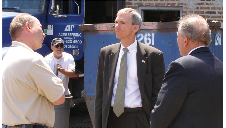
Congressman Lipinski meets with workers in Bridgeport to discuss the economy.

of dollars in year-end "performance" bonuses – effectively subsidized by taxpayers – as Americans continue to lose their jobs.