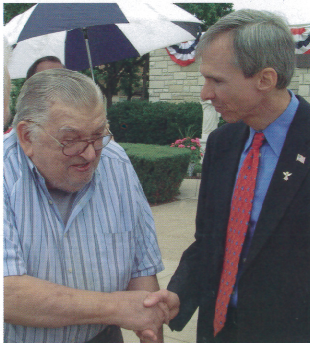
Congressman Lipinski discusses Medicare and the need to lower prescription drug prices with a local senior.