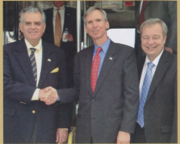
Lipinski toured CREATE project sites with U.S. Transportation Secretary Ray LaHood (left) and Illinois Transportation Secretary Gary Hannig (right).

Congressman Lipinski's work with state leaders helped to secure $300 million in Illinois' new capital bill for the CREATE rail modernization program, which will reduce congestion in and around Chicago while creating jobs and improving safety. CREATE includes the construction of a number of overpasses and underpasses where traffic currently gets blocked by trains. Other work will improve Metra service and help reduce idling by trains that creates pollution and noise. Every day, 1,200 trains pass through the Chicago area, supporting 38,000 jobs, but if improvements are not made the region could miss out on 17,000 new jobs. The only Chicagoland member of the powerful House Transportation & Infrastructure Committee, Lipinski previously obtained $100 million in federal funding for CREATE and is seeking more in the next federal transportation bill.