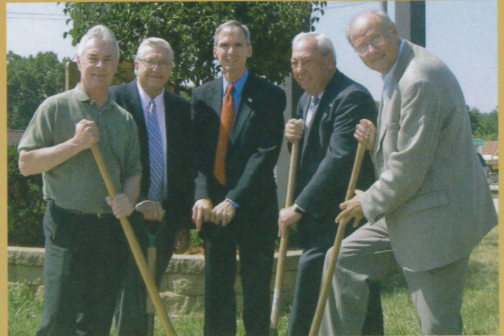
Lipinski breaks ground with local mayors on Harlem Avenue streetscaping paid for with a $3.28 million federal grant he obtained.