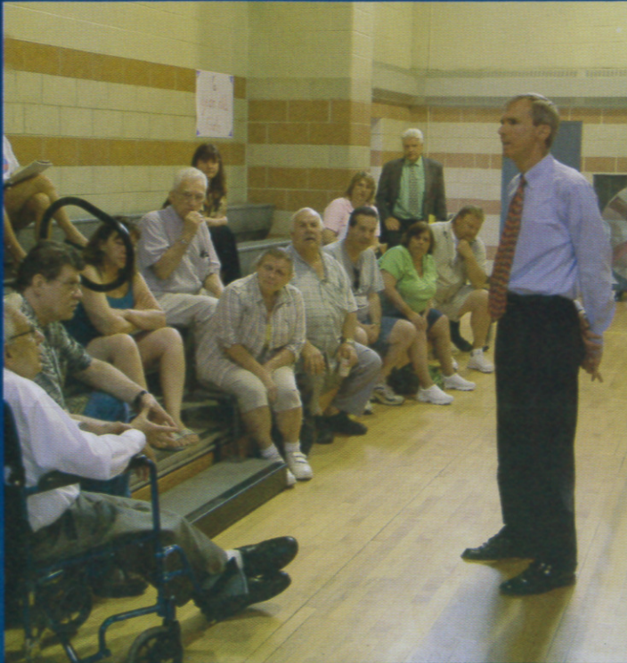
Lipinski meets with constituents and discusses his opposition to the bailout.

Congressman Lipinski voted three times against the $700 billion Wall Street bailout, known as the Troubled Asset Relief Program. A year later, his predictions about the bill have unfortunately come to pass. We still don't know what the banks have done with the billions they were given, executives at bailed-out firms have taken home huge paychecks, foreign banks received taxpayer money, reforms have not been passed, and – most importantly –