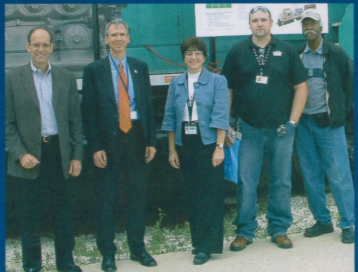
Lipinski recently toured Electro-Motive Diesel, a leading manufacturer of locomotives that employs 1,600 people in La Grange.

to help those struggling to find work. Congressman Lipinski is focused on ensuring America rebuilds its economy on a foundation of real profits, not creative accounting, financial sleight-of-hand, and mountains of debt.