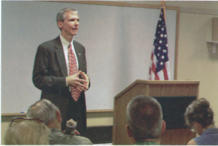
Lipinski discusses health care with constituents at a town hall meeting.

Since entering Congress, Congressman Lipinski has made it a top priority to reform our health care system so it works for the well-being of all Americans, not just for the profits of the health care industry. The rapidly rising cost of health care is placing an extraordinary burden on individuals, businesses, and the government. Families need health care, but they are struggling to afford it, especially in these very tough economic times.