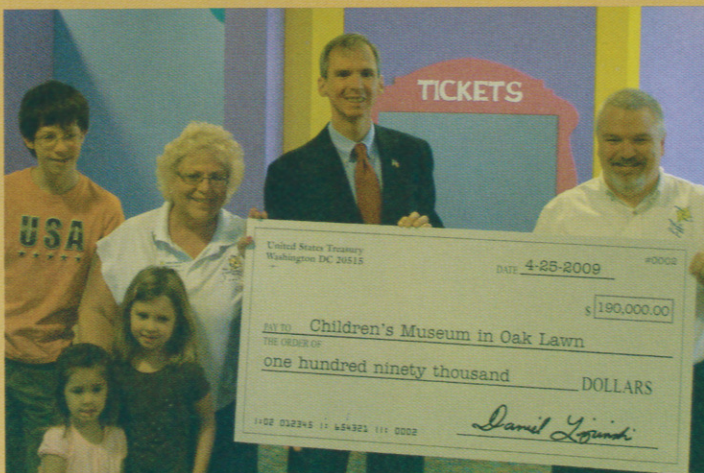
Congressman Lipinski secured $190,000 in federal money for educational programs for the Oak Lawn Children's Museum.

19 West Hillgrove Ave. La Grange, Illinois 60525 708-352-0524