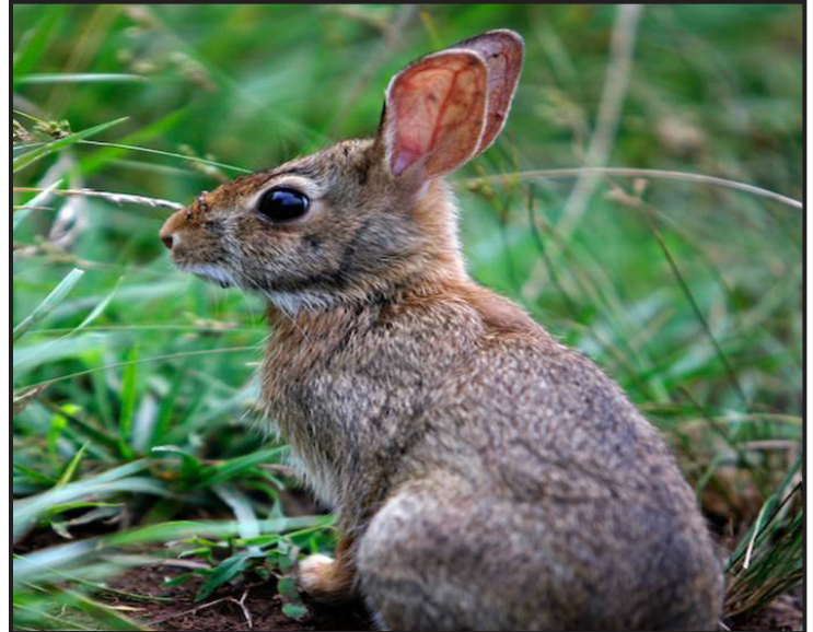
The Inventory and Monitoring Program is providing data to improve our understanding and management of park natural resources. Like this rabbit, our staff have big ears and listen closely to determine needs.

To facilitate collaboration, information sharing, and economies of scale in inventory and monitoring, the NPS has organized more than 300 parks with significant natural resources into 32 ecoregional networks to conduct inventory and monitoring activities.