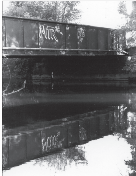
Graffiti offenders risk injury by placing graffiti on places such as this railroad bridge spanning a river.