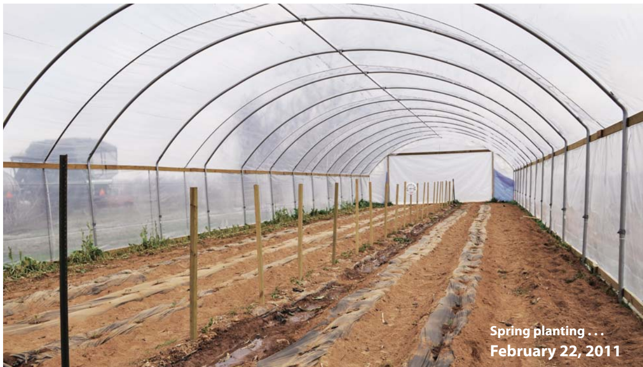
Spring planting ... February 22, 2011

High tunnels are structures that modify the growing climate, allowing for tender, sensitive, and specialty crops like certain varieties of vegetables, herbs, berries, and others to grow where they otherwise may not. High tunnels are constructed of metal or plastic bow frames at least six feet in height and covered with a single layer of polyethylene.