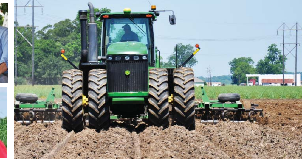
Louisiana's Conservation Update | Page 5