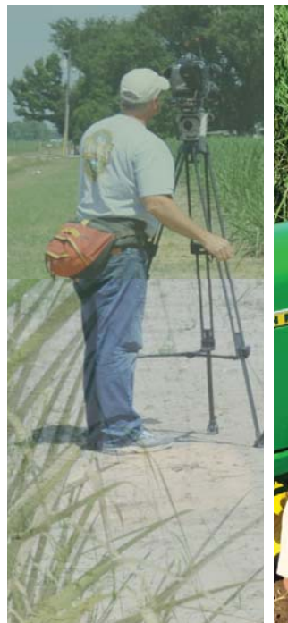
America's Heartland, a weekly public television series, visited Louisiana recently to tape an episode featuring Blanchard Brothers Farm in Jeanerette, Louisiana.

The episode, which will air in the fall, will spotlight the life and times of this hard-working south Louisiana farming family.