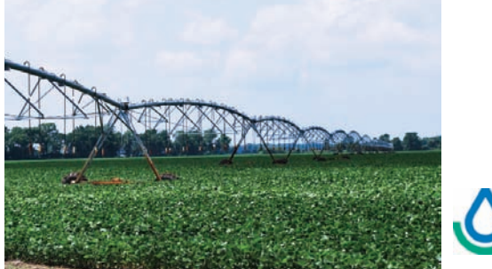
Page 6 | Louisiana's Conservation Update