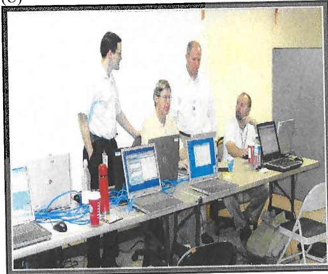
(U) Source: OIG auditors conducting security scans on laptop computers in Austin, TX.