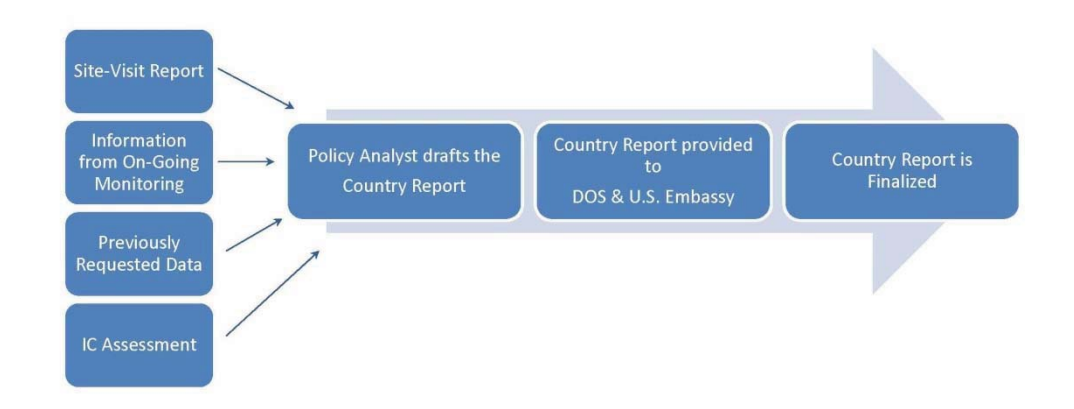
Figure 1. Country Report Process