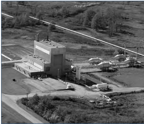
Aerial view of the Spacecraft Propulsion Research Facility, October 1999.

required. As explained by Les Main, GRC Historic Preservation Officer, these agencies understand and support NASA's reuse of our specialized facilities. The consultation process is required under the National Historic Preservation Act and is governed by an Agency-wide Programmatic Agreement executed in 1989. The consultation provides a means to ensure that unique engineering and architectural features of the B-2 test building are documented before they are altered or removed. It is a valuable exercise for a resource with limited public visibility. Documentation also provides a means of maintaining records of historic systems for future study by space system engineers and architects.