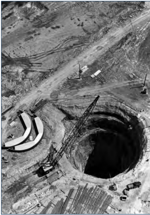
Construction of the B-2 site required the excavation of a 180-foot-deep hole, pictured here in 1965.

Although GRC had already expanded its original aeronautics capabilities and was directly supporting NASA's space missions, construction of the B-2 site and the Space Power Facility (constructed at the same time) expanded GRC's contribution to space exploration. The B-2 site directly contributed to the success of the U.S. space program, earning it the designation of a National Historic Landmark in 1985. The B-2 test facility was nominated to the National Register of Historic Places as part of the Man-in-Space NHL Theme Study conducted by the National Park Service. It was one of three sites grouped as Rocket Engine Development Facilities. Along with the Rocket Engine Test Facility and the Zero-Gravity Research Facility, the nomination states that these sites represent the "important role of the Lewis Research Center in developing hydrogen as a fuel for Centaur and Saturn V rockets."