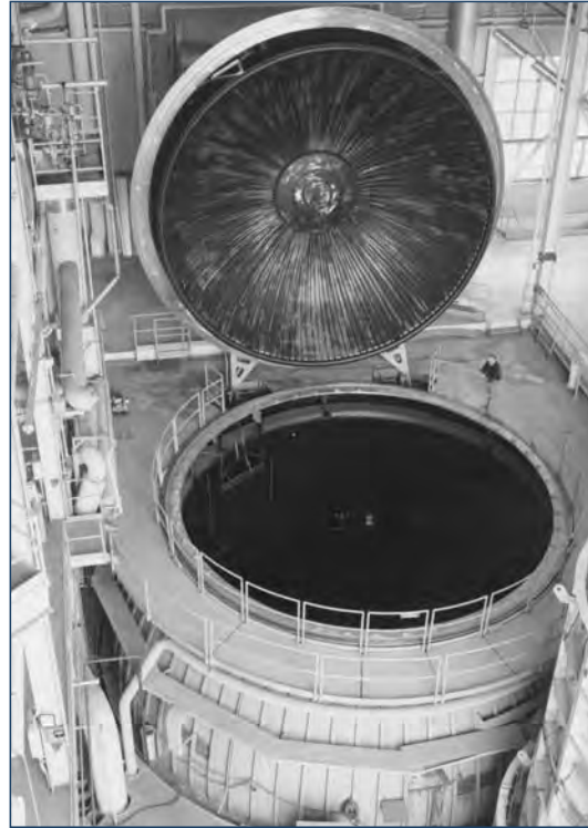
An unidentified man stands beside the open B-2 vacuum chamber in 1987.

Though the station's steam supply needs to be refurbished, the B-2's vacuum tank could be available for tests conducted in 2009. GRC is hopeful that the B-2 site will be used to support the upcoming Constellation Program. Pending the results of an ongoing trade study, the B-2 site may be selected to provide verification of start-at-altitude testing for launch vehicles supporting the lunar program, e.g., Ares V, and possibly to support testing associated with the Lunar Lander. If Constellation does use the B-2 site, consultation with the Ohio State Historic Preservation Officer (SHPO), National Park Service, and Advisory Council of Historic Places (ACHP) would be triggered if major modifications to the test building would be