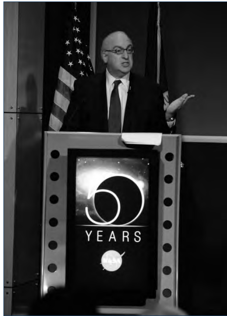
Award-winning biographer and historian Laurence Bergreen discusses voyages to Mars on the second day of the 50th-anniversary conference.