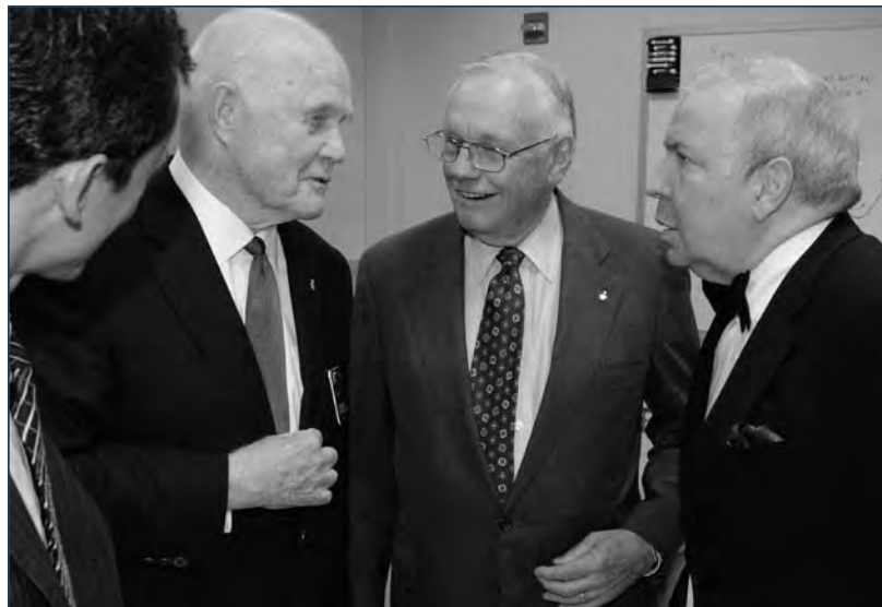
Astronauts John Glenn (left) and Neil Armstrong (center) chat with Frank Sinatra, Jr. (right), before NASA's 50th-anniversary gala.