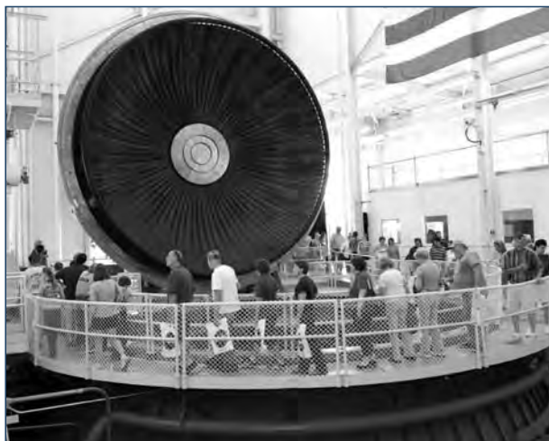
Visitors receive a rare glimpse inside the B-2 vacuum chamber in May 2008, the first time the facility had been opened to the public since 1999.

The NHL nomination lists the B-2 vacuum chamber as a structure contributing to space exploration, transportation, and education; the nomination states, "The successful development and use of the Centaur was due in large measure to data that was collected from successful test firings of Centaur engines in the facility." Designed to launch satellite payloads into orbital altitudes and give interplanetary space probes escape