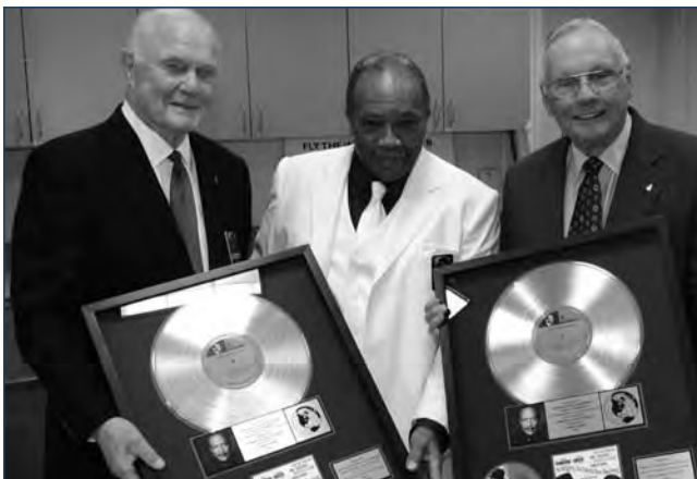
Grammy Award-winning producer Quincy Jones (center) presents a platinum copy of “Fly Me to the Moon” to Senator John Glenn (left) and Apollo 11 commander Neil Armstrong (right) during NASA’s 50th-anniversary gala. The plaques thank the astronauts for helping to boost sales of the song’s album, It Might As Well Be Swing.