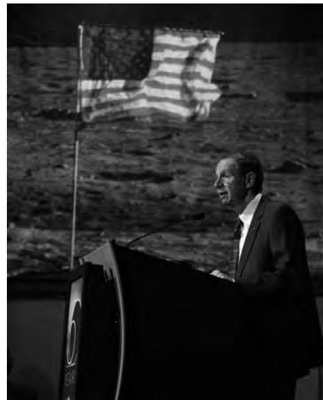
NASA's 11th Administrator, Michael Griffin, opens the conference with his thoughts on NASA at 50.