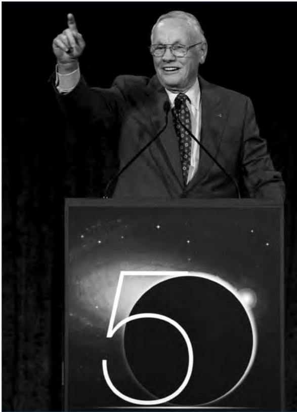
Neil Armstrong—astronaut, professor, United States naval aviator, and first human on the Moon—addresses guests at the celebration.

Photos from the Gala Held at the NASM's Udvar-Hazy Center, 24 September 2008