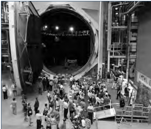
JSC open house, 2005. Overall view of visitors listening to Heather Paul and Amy Ross at the spacesuits exhibit in Building 32, with Chamber A's 40-foot door open in the background. (Image Number jsc2005e16878)

Since it was constructed in 1965, the SESL has tested all Apollo command and service modules, Apollo lunar modules, space suits for extra-vehicular activity, the Skylab/Apollo telescope mount system, various Space Shuttle systems, the Apollo/Soyuz docking module, many assembled-in-orbit components of the International Space Station, and various large scale scientific satellite systems such as the parabolic reflector subsystem of the Applications Technology Satellite. The thermal vacuum testing done at the SESL since 1965 has been a significant factor contributing to the success of both the manned and unmanned space program of the United States.