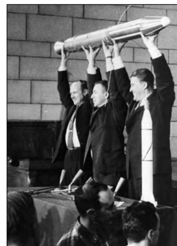
Pickering, von Braun, and Van Allen show Explorer 1 to the world on 1 February 1958.

The careers of von Braun and Van Allen have been covered elsewhere. This book presents a personal view of the life and times of William H. Pickering.