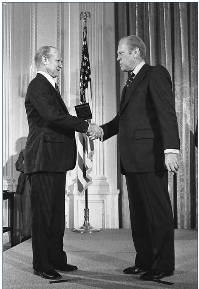
William H. Pickering receives the 1975 National Medal of Science from President Gerald R. Ford on 18 October 1976.

As a result of these efforts, many new, non-space-related projects ran in parallel with the ongoing NASA programs at JPL. These projects were funded, with NASA concurrence, by independent agencies. Projects in the fields of urban mass transportation, city government, education, law enforcement, and biomedics and solar energy are examples.