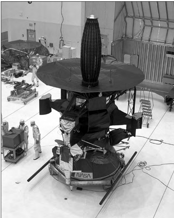
In the Vertical Processing Facility (VPF), the spacecraft Galileo is prepared for mating with the Inertial Upper Stage booster. Galileo was launched aboard the orbiter Atlantis on Space Shuttle mission STS-34, 12 October 1989, and sent to the planet Jupiter on a journey that took more than six years to complete.

the spacecraft also visited Io and mapped its cloud of charged particles and the density of sulfur streaming from Io's erupting volcanoes.