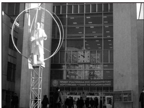
The Bauman Moscow State Technical University's Bauman Center (note statue of Korolev).

ence of several hundred people with a short introduction in which he mentioned the anniversaries this year (besides Korolev and Tsiolkovsky): the launch of Sputnik (50 years), the launch of the first R-7 missile (50 years), the birth of pioneer Fridrikh Tsander (120 years), and the birth of Korolev's successor, Vasily Mishin (90 years).