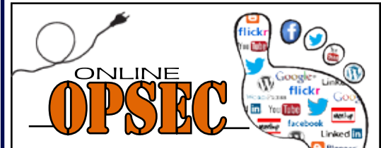
Managing your digital footprint