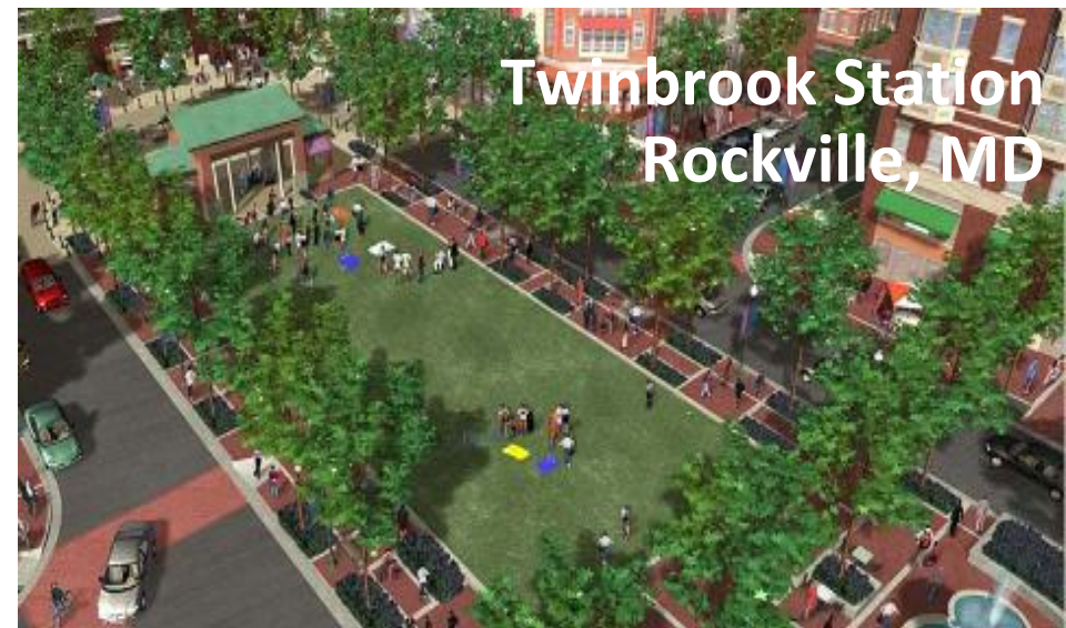
Twinbrook Station Rockville, MD