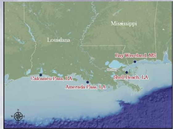
Sentinel Locations in the Gulf

Real-time data from all of NOAA's NWLON stations are available on the internet http://tidesonline.nos.noaa.gov and show observed water levels in relation to tidal datums and predicted levels. During tropical storm warnings CO-OPS provides Storm QuickLook, a compilation of near real-time oceanographic and meteorological observations within the affected coastal area. An overlay map of NOAA satellite imagery and National Weather Service forecast information displays storm characteristics relative to CO-OPS water level measurement stations. The plotted data are summarized along with the time of the next predicted high tides.