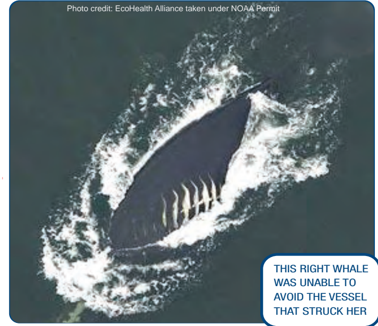
THIS RIGHT WHALE WAS UNABLE TO AVOID THE VESSEL THAT STRUCK HER