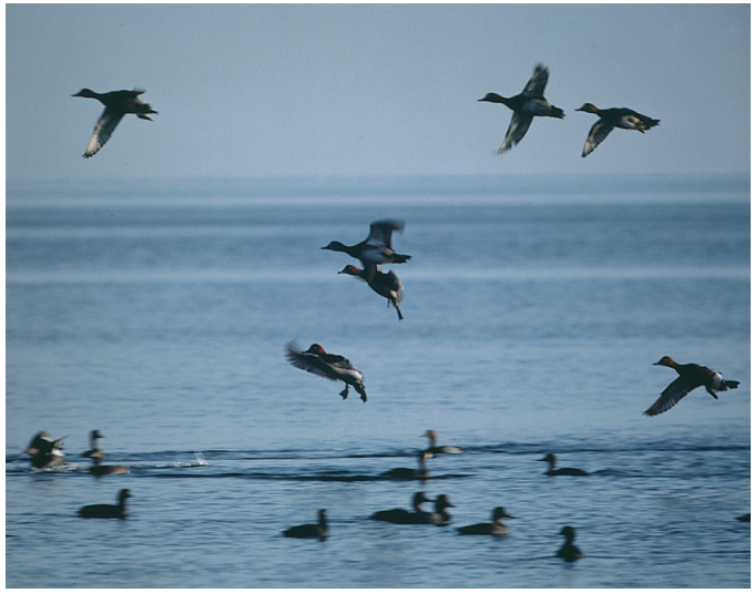
Redheads in Pamlico Sound.