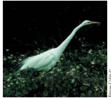
Bruce Colin ©

Over 250 species of birds have been identified on the refuge. Osprey, swallow-tailed kite and bald eagles are among the ninety species that nest on the area.