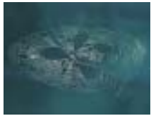
Bruce Colin ©