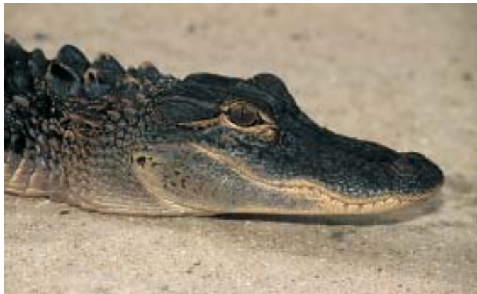
Bruce Colin ©