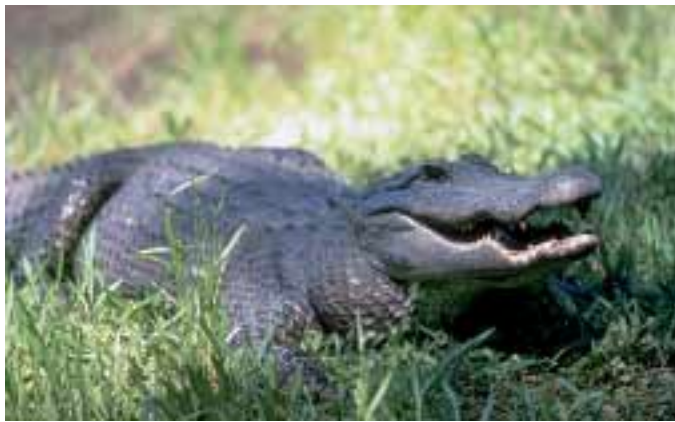
Above: American Alligator Right: Slider