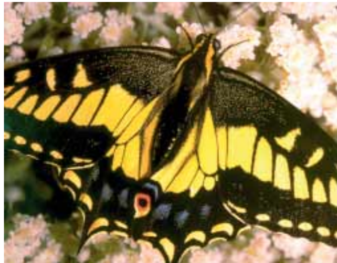
Schaus Swallowtail Butterfly

This unique system encompasses over 92 million acres of lands and waters from north of the Arctic Circle in Alaska to the subtropical waters of the Florida Keys and beyond to the Caribbean and South Pacific.