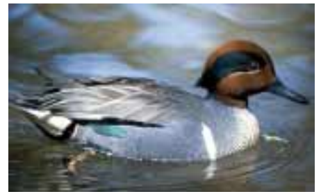
Bottom: Wood Ducks