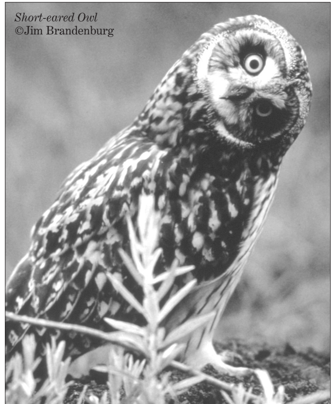
Short-eared Owl

Birdwatching is encouraged! For more information, or to report any unusual sightings, please contact refuge person-