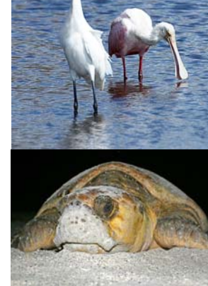
Above: white egret and spoonbill; below: loggerhead sea turtle

A maze of mangrove islands and narrow waterways serve as the nursery for many plants, animals and fish and define the area known as Ten Thousand Islands National Wildlife Refuge. The 35,000-acre refuge provides vital habitat for all kinds of protected plants and animals. Nearly 200 fish species have been documented in the waters, which are also home to several endangered species including the West Indian manatee, Snail Kite. Peregrine Falcon, Wood Stork,