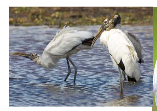
Left to right: woodstorks, tri-colored heron, West Indian manatee and calf. raccoon. oystercatcher, swallow-tailed kites, dolphin and white pelicans, all USFWS/ Larry Richardson.

As times have changed, the importance of the refuge increases with the pressure of growing cities which continue to change the landscape. The need to preserve and set aside natural areas for our nation's wildlife serves to protect our ecological systems as well as to provide beautiful areas for recreation and wildlife observation.