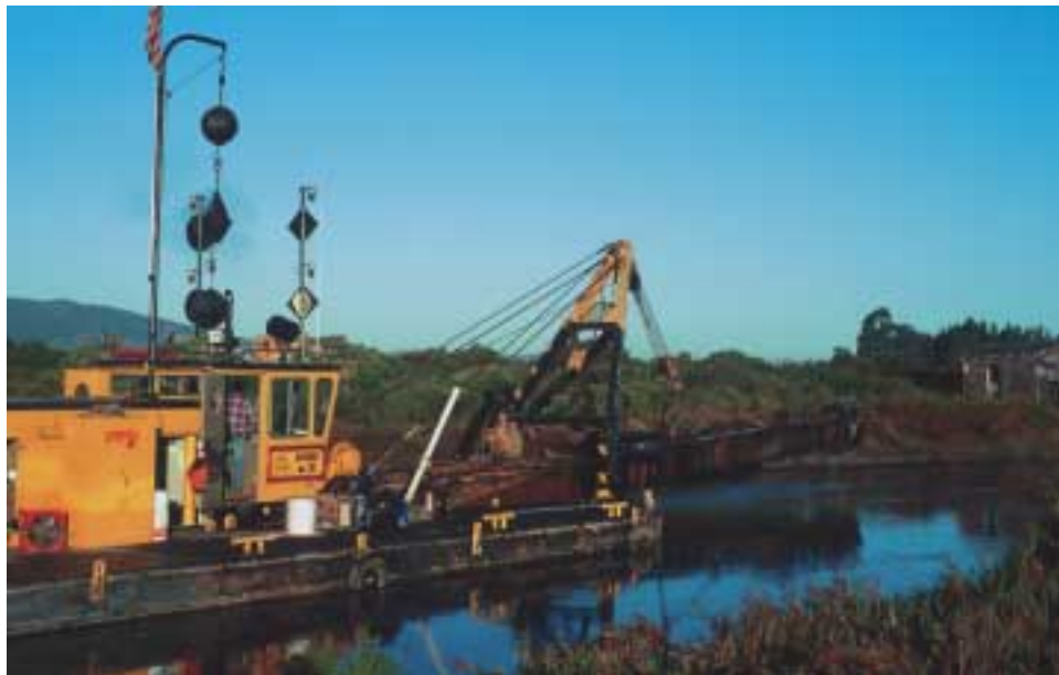
Dredge work was done both to enlarge channels, thereby restoring tidal action in Tolay Creek, and to improve levees to protect adjacent farmland.