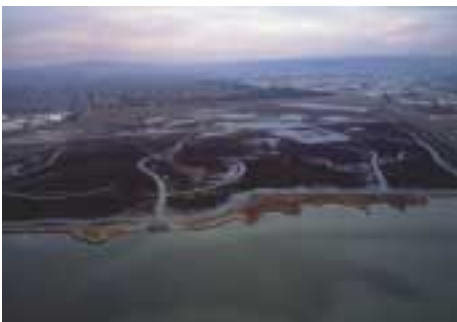
After restoration: tidal wetlands, brackish pond and upland habitat.

"This marsh restoration project ... represents an effort by multiple agencies and organizations to acquire and restore key endangered species habitats where they are needed in the Bay area."