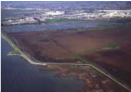
Before restoration: diked seasonal wetland and salt pan.

To restore tidal action to the property, EBRPD proposed that the site be appropriately graded and then the levees be breached at two locations, opening the site to tidal flow from San Francisco Bay. The ponds formed from these actions would support emergent tidal marsh as well as tidal channels, mudflats, and loafing islands. These habitats would support large populations of waterfowl and shorebirds, while minimizing mosquito populations by eliminating areas of stagnant water.