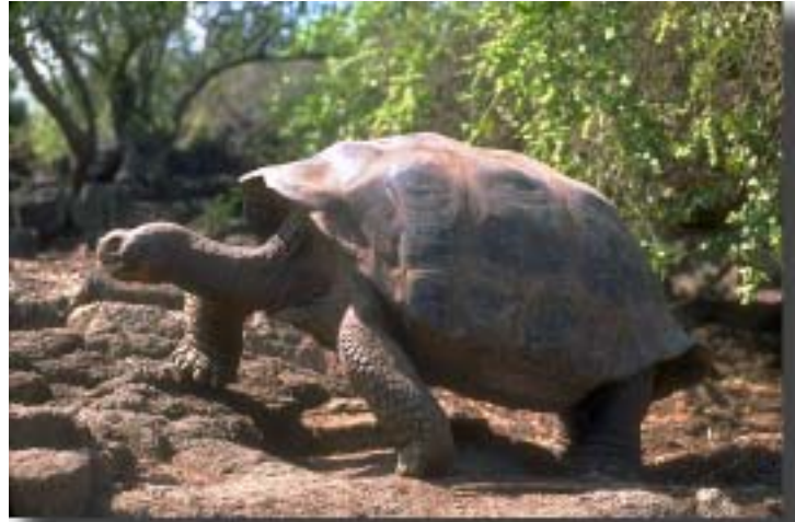
Galapagos giant tortoise

The prohibitions apply equally to live or dead animals or plants, their progeny (seeds in the case of plants), and parts or products derived from them.