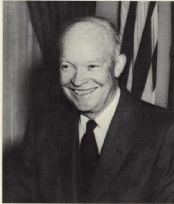
DWIGHT DAVID EISENHOWER 1890-1969 34th President of the United States General of the Army