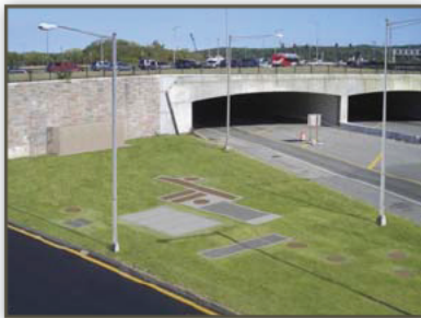
DC Clean Rivers Project (3)