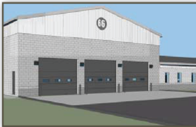
Fire station expansion at Fort Belvoir (5)