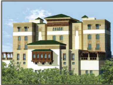
Chancery of Morocco (1)

During the past month, the Executive Director approved 11 projects under the Commission's delegated authority: