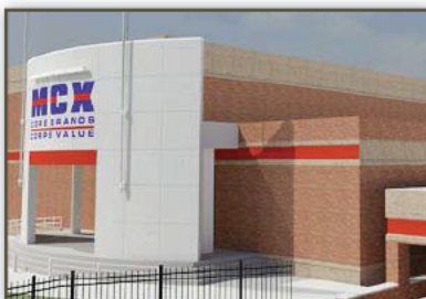
Marine Exchange at Joint Base Myer-Henderson Hall (7)