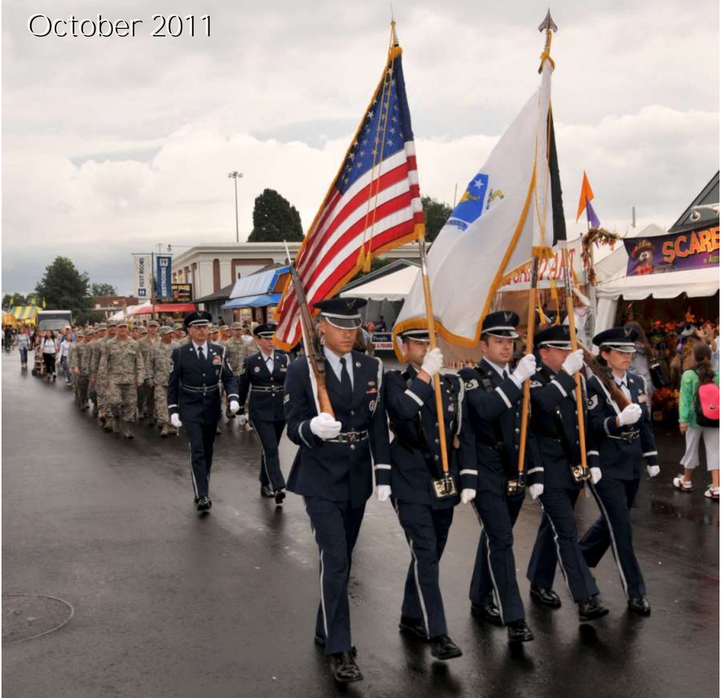
Led by the 104th Fighter Wing's base Honor Guard, unit members, and family members march in the Westfield Day Parade at the Big E, West Springfield, MA, on September 29, 2011.