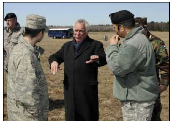
Paraguayan Senator Saguier discusses F-15 operations during his tour.

The delegation toured the base, learned about the Air Sovereignty Alert mission and the capabilities of the F-15. The Paraguayan military is growing in size and complexity and this visit is part of their strategic planning process. The