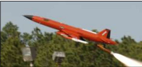
Air Force Target Drone (File photo)

Members of the 104 th Fighter Wing are deploying to Tyndall AFB in Florida for two weeks in April for the Weapons System Evaluation Program (WSEP). This will be the first opportunity for the 104 th members to test the Operations and Maintenance system while deploying F-15s with people and cargo while loading live munitions with the F-15s.