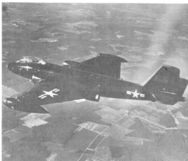
This B-57 Intruder flying over open country, not unlike the terrain around here, foreshadows what will soon be an everyday sight in the skies around Barnes, Logan and Hancock Fields, once the three squadrons of the 102d Tactical Bomber Wing get into operational status with the new birds.

The first of 15 newly-assigned B-57 Intruderjet bombers is slated to arrive here in the early part of next month, with delivery of the remainder spaced out until the middle of May.