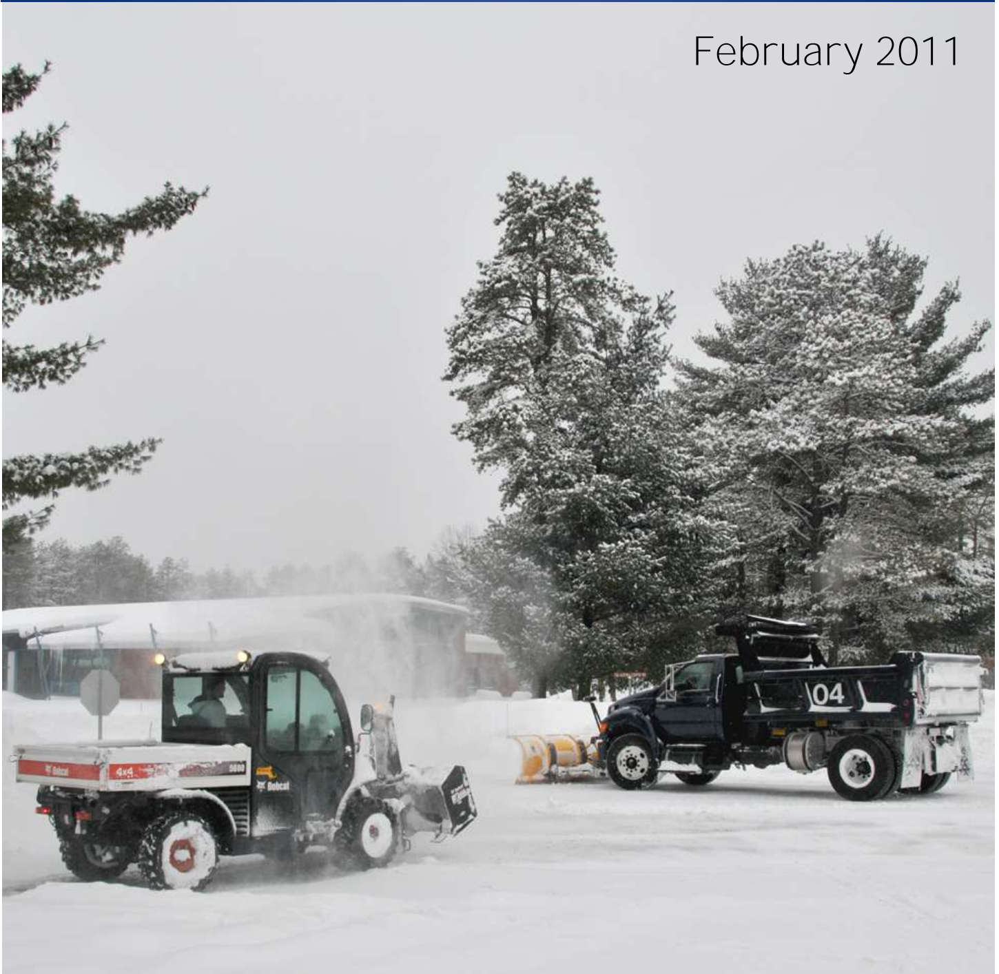
Civil Engineering busy plowing base streets and walkways as multiple snow plows clear the runways during the two day blizzard of 2011 on Tuesday and Wednesday, February 1 & 2, 2011.