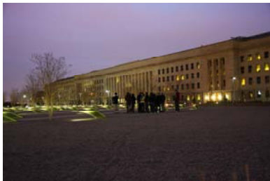
Some say the Pentagon Memorial looks even more breathtaking at night than it does during the day. As a result, it is a popular night-time destination for visitors.