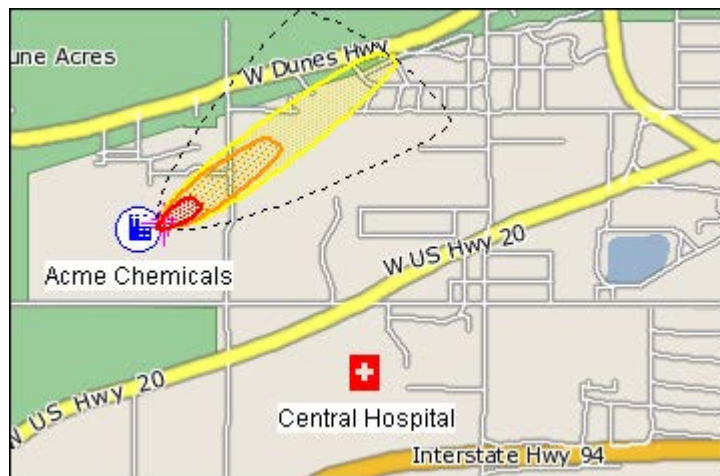
ALOHA threat zone (near the chemical facility object) displayed on a sample MARPLOT map.

Important data about these locations (such as emergency contacts, hours of operation, and chemical inventories) can be displayed in the CAMEO fm data modules to help you make decisions about the degree of hazard posed by the incident.