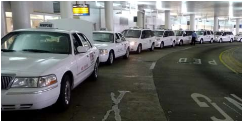
Taxis line up to transport incoming passengers at Baltimore/Washington International Airport.