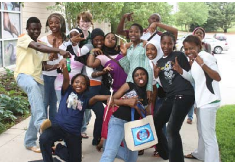
Nigerian and Tanzanian students at an IRIS program.