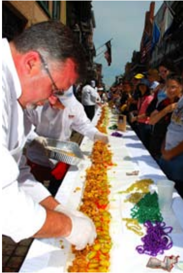
The world's longest oyster po' boy is prepared for a street festival in New Orleans.