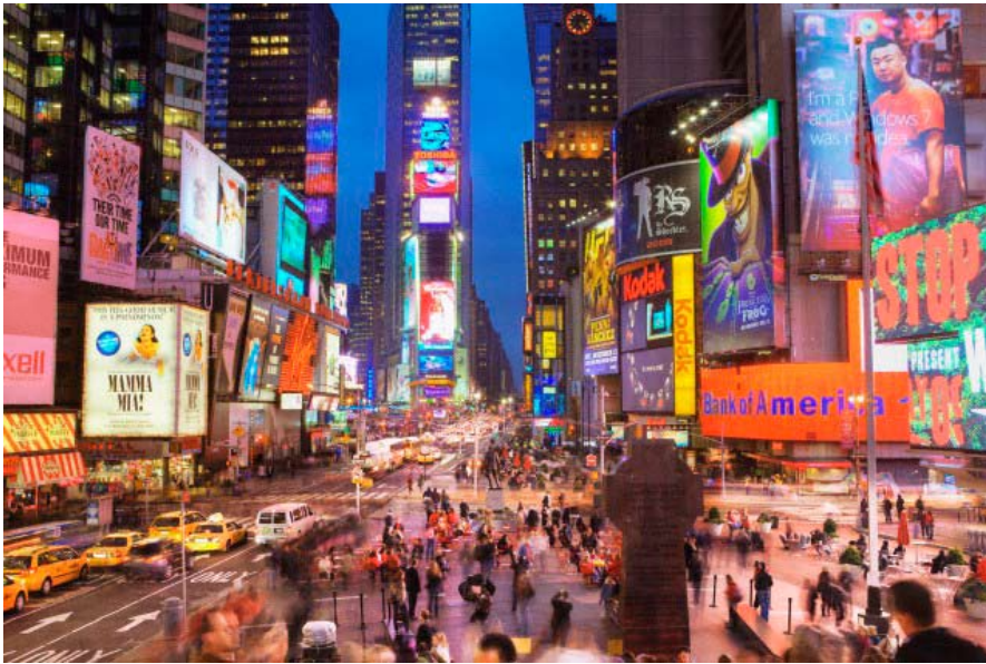
Times Square, part of the New York City nightscape.