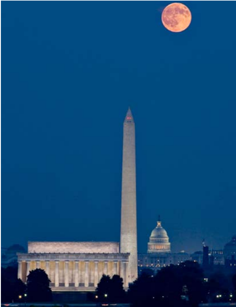
A full moon over Washington, D.C., illuminates the Lincoln Memorial (foreground), the Washington Monument (center), and the U.S. Capitol (background).

urban, the city has always preserved its green, natural spaces. One finds surprising solitude on the trails winding around Roosevelt Island, which sits peacefully in the middle of the Potomac River. And, of course, one of the greatest attractions is the National Mall, America's front yard. Spread a blanket on the grass and relax surrounded by monuments honoring some of the country's most important leaders.