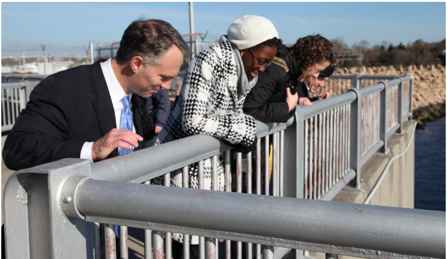
New Bedford Mayor Jonathan Mitchell and event attendees examine the barrier gates.

Cove Road, and a pumping station. Fairhaven Dike consists of earthfill with stone slope protection. It starts at high ground near the foot of Lawton Street and runs easterly about 3,100 feet, with a maximum elevation of 20 feet. The dike also has a four-foot-diameter gated conduit.