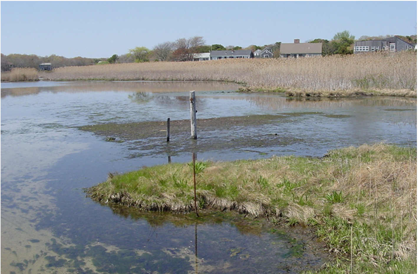
The lower east end of Stewart's Creek that is scheduled to be restored.