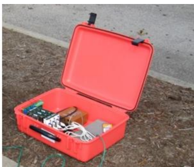
Sensor controller, location, and communication box.

Phase A of the project consisted in the development and testing of a prototype system composed of sensors that are engineered in such a way that they can be rapidly deployed in the field where and when they are needed. Each one of these sensors is also equipped with their own power supply and a GPS device to auto-determine its spatial location on the transportation network under surveillance. The system is capable of assessing traffic parameters by identifying and re-identifying vehicles in the traffic stream as those vehicles travel on top of the detectors. The system of sensors transmits, through wireless communication, real-time traffic information (travel time and other parameters) to a command and control center.