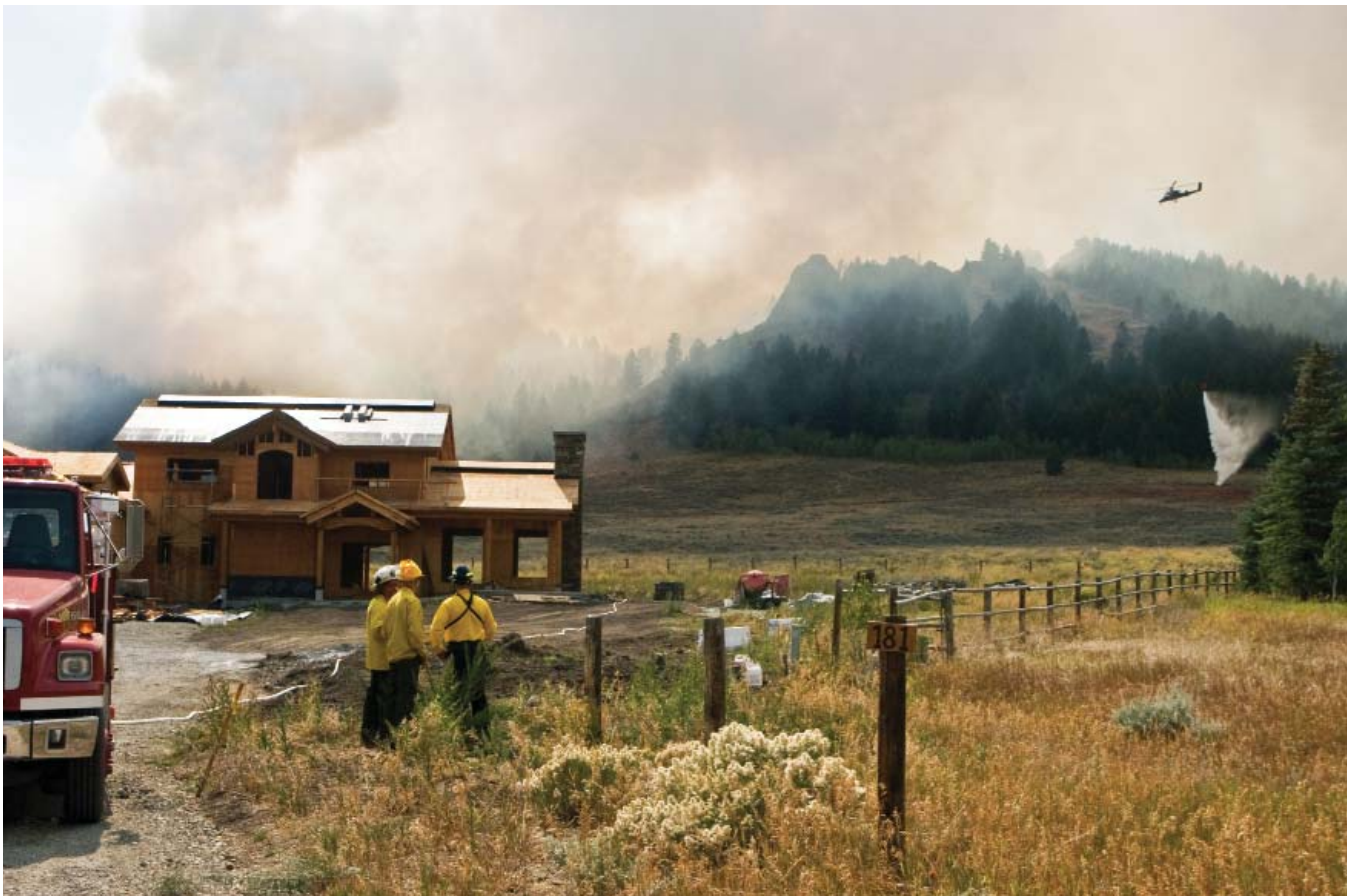
Protecting structures in the Wildland Urban Interface. Castle Rock Fire, Ketchum, ID, 2007.

To maintain consistent messaging and to ensure that stakeholders have equal opportunity to participate, communicators will be provided with the core principles of communication, overarching messages and a number of suggested actions and products that can be easily adapted to their unique communication environments. Long-term tactics are discussed under Implementation of the Communication Framework below.