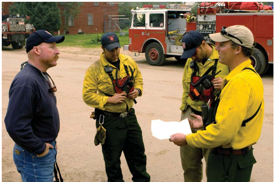
Firefighters talk to a home owner in the wildland urban interface on the Cascade Complex, Idaho, 2007.