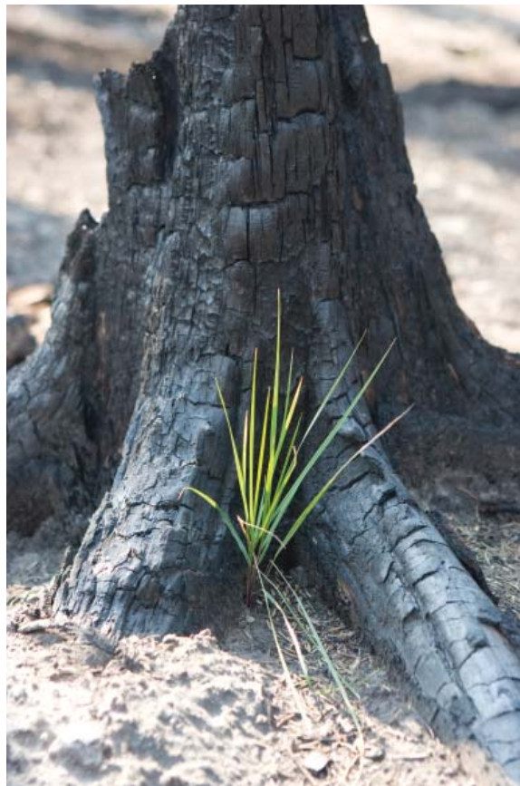
Regrowth on the Cascade Complex, Idaho, 2007.