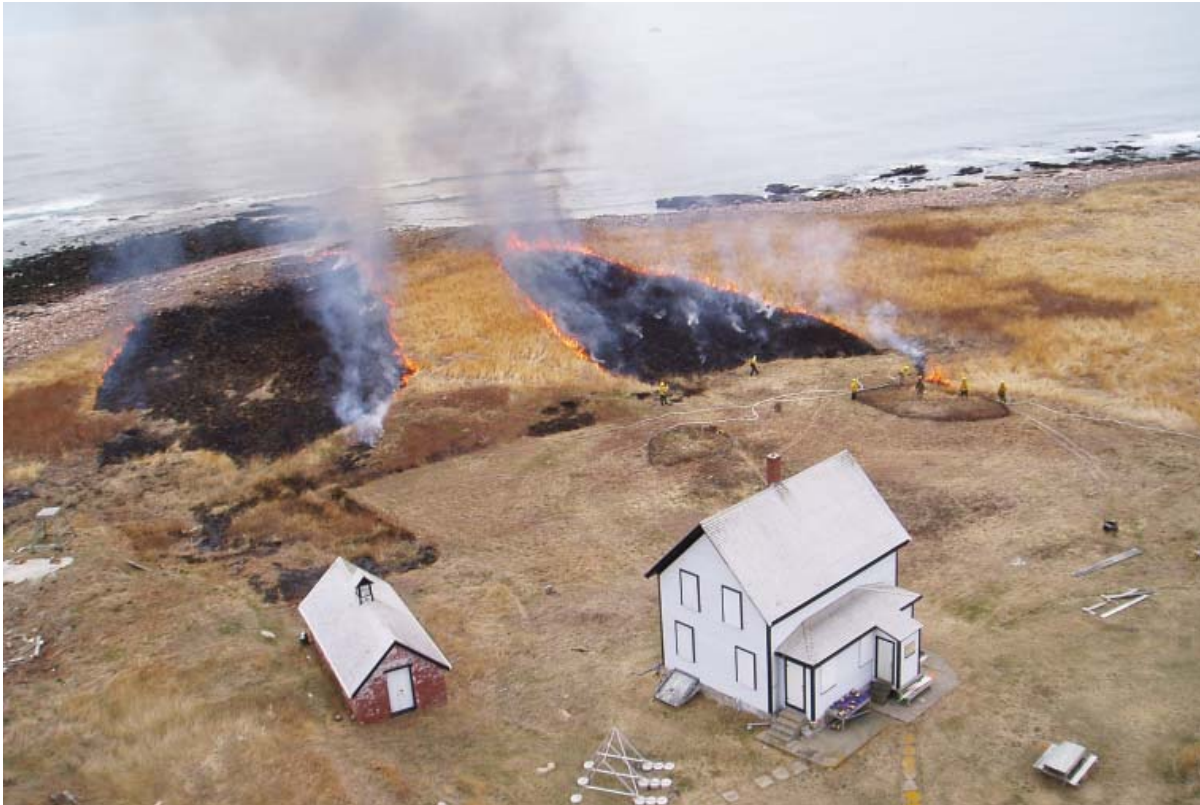
Firefighters ignite a prescribed fire near homes near the Petit Manann National Wildlife Refuge in Maine.

The National Cohesive Wildland Fire Management Strategy is an ongoing effort by federal, tribal, state and local governments and non-government organizations to address growing wildfire challenges in the United States.