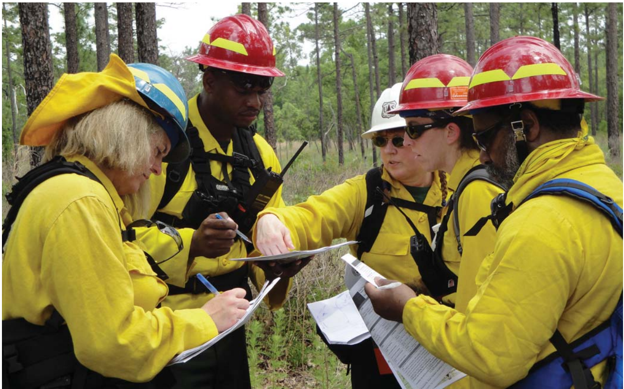
Fire managers and personnel collaborate to discuss the best strategies.

Communications and the directions set by this document is a critical part of the Cohesive Strategy efforts – without it there will not be an understanding or buy in by the people who fund these efforts, support these efforts, implement these efforts or are the ultimate customer of these efforts, the citizens of the United State of America.