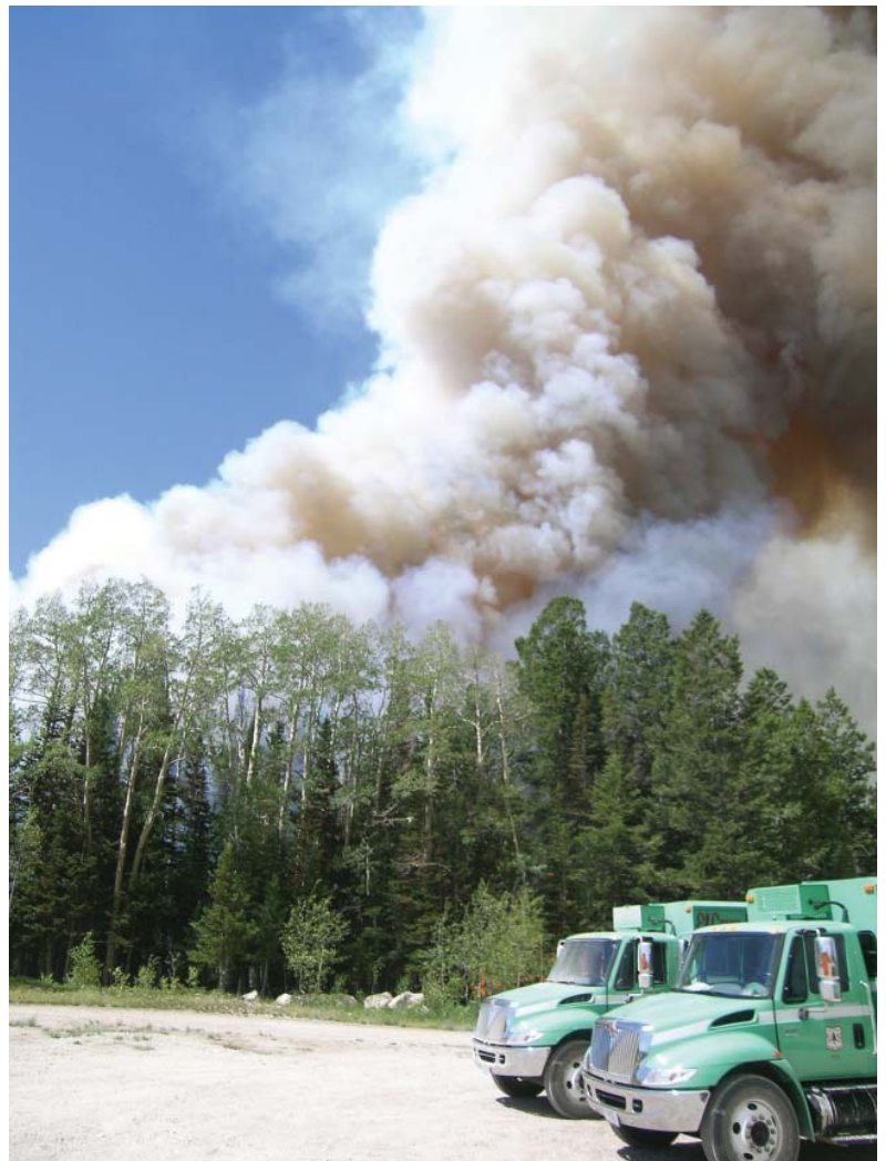
Smoke billows on the horizon, 2010.