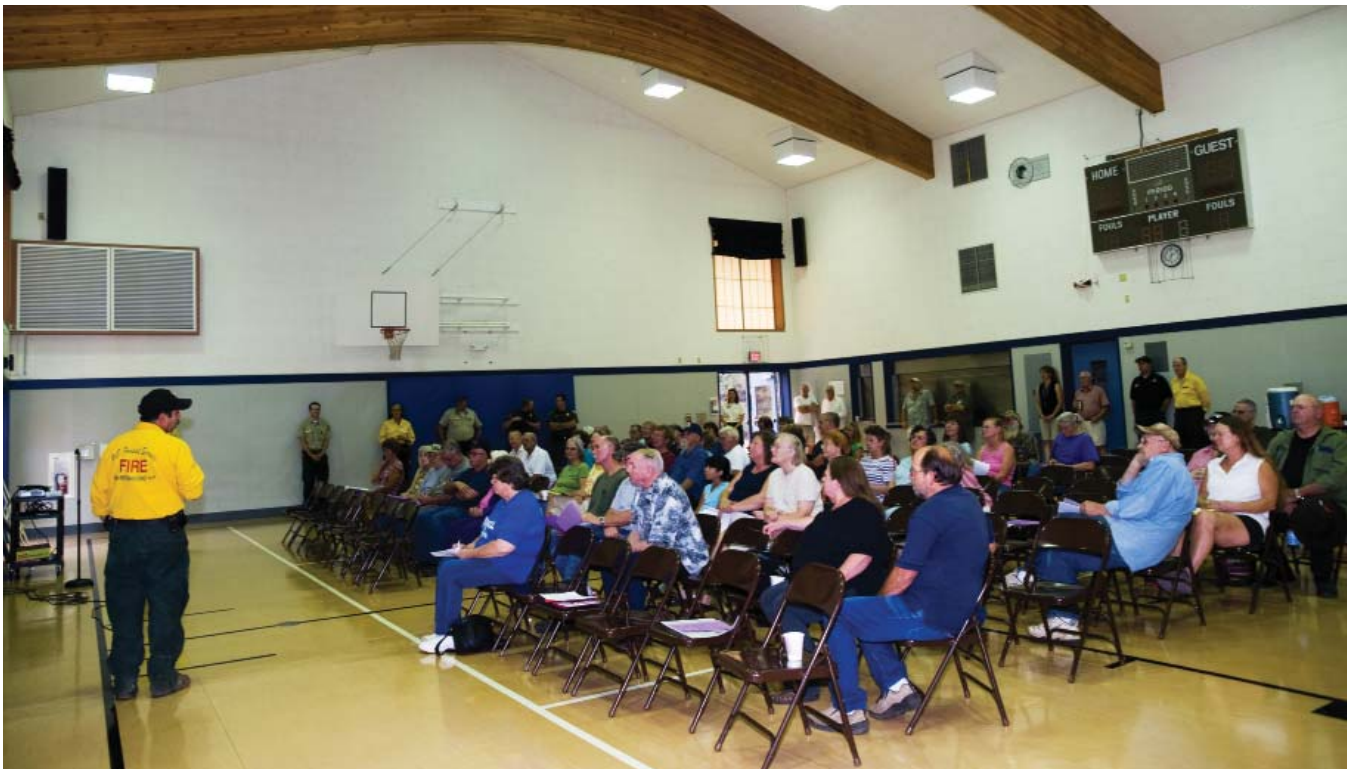
Information Officers and fire managers conduct a community information session in northern California, 2008.

Audiences are those people, groups, organizations, agencies or other levels of government who affect, are affected by, or have a relationship to the issue at hand. Knowing and understanding that relationship will help in customizing messages and strategies for reaching each audience.