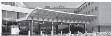
2010 Washington, DC