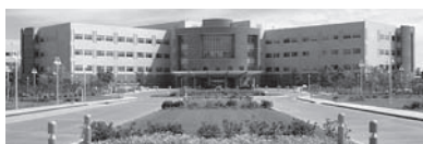
2007 Palo Alto, CA