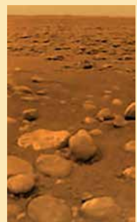
Titan as seen by the Huygens lander