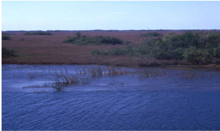
The Asian swamp eel thrives in adverse conditions. This air-breathing creature has a voracious appetite for fish, frogs, and aquatic invertebrates. It has turned up in a canal adjacent to the Florida Everglades.