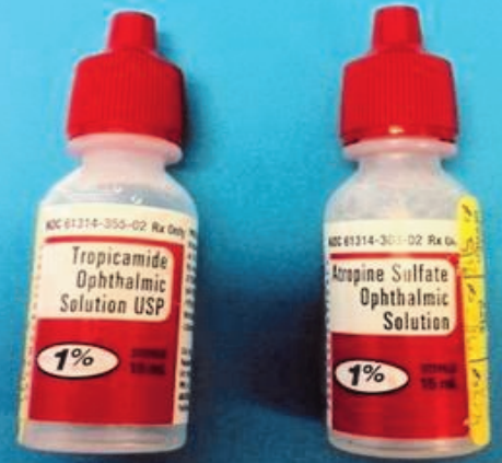
Figure 1. Potential Look-Alike Confusion Due to Similar Product Packaging - Tropicamide Ophthalmic Solution USP 1% and Atropine Sulfate Ophthalmic Solution USP 1%